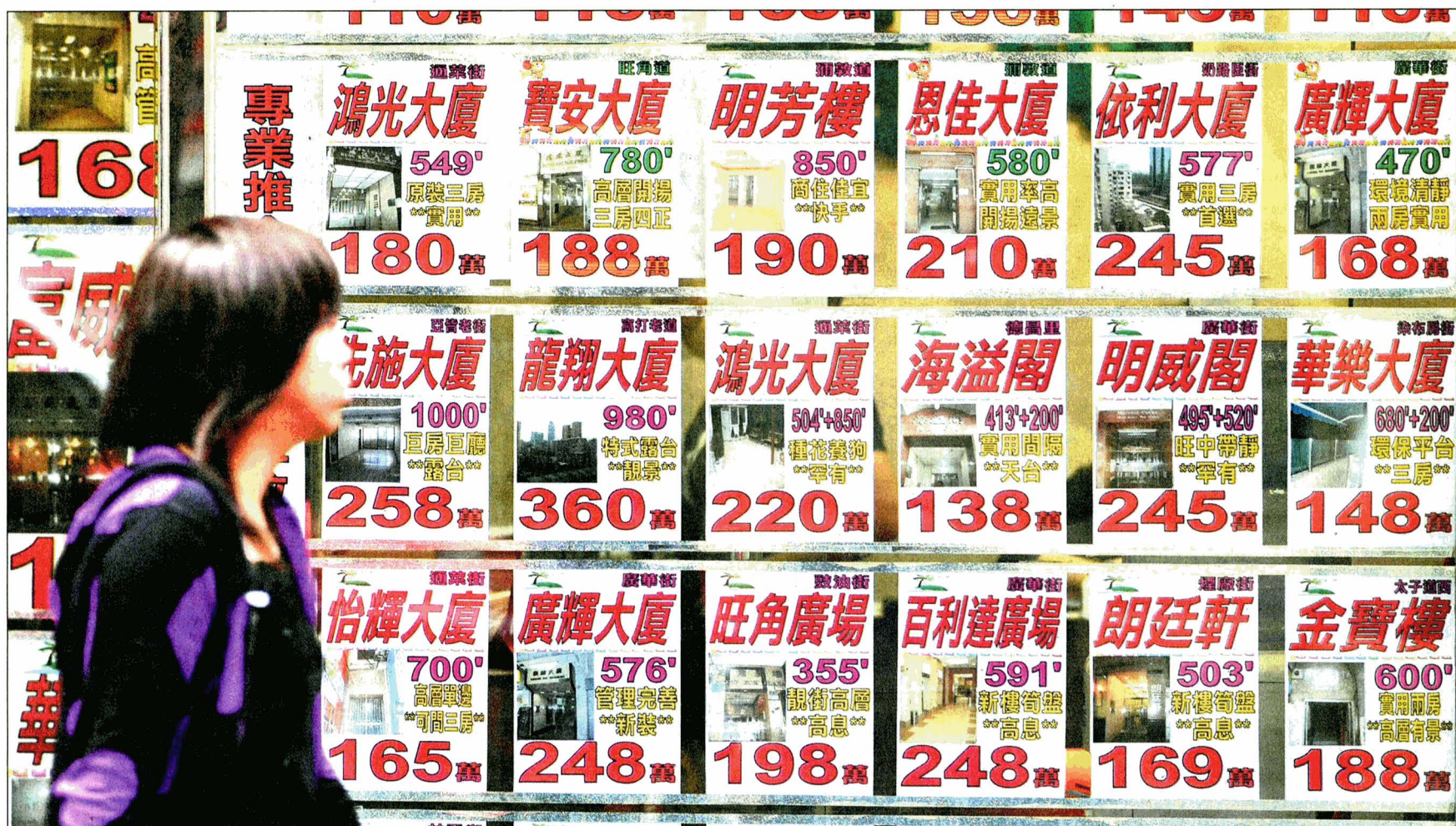
A pedestrian walking past a real estate office in a popular shopping district in Hong Kong. In the Chinese city and Singapore, governments have introduced several measures to curb real estate bubbles, including stamp duties and lower mortgage percentages.